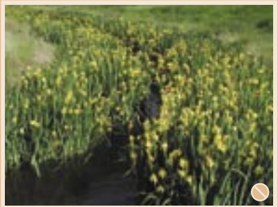
WA State Noxious Weed Control Board